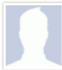
M.R. Lieutenant U.S. Navy

Three weeks later I was examined. No mitral valve prolapse! A congenital defect of thirtythree years had disappeared. All the diagnostic equipment and tests revealed a perfect heart. I was returned to flight status."