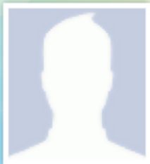
Alexis Smith, Hollywood